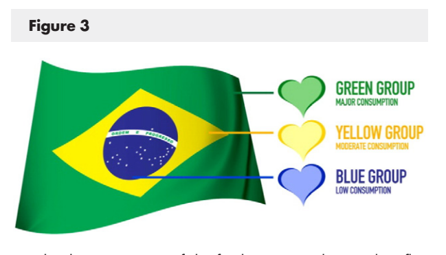
Graphical representation of the food groups in the Brazilian flag (color in print).

was to compile a list of cardioprotective foods, based on a set of qualitative criteria: (a) no added sugar; (b) low calorie content; (c) lack of nutrients that increase cardiovascular risk (cholesterol, saturated fat, and sodium); and d) presence of cardioprotective nutrients (antioxidants and dietary fiber). To compile this list of foods, we used the Nutriquanti software suite,<sup>16</sup> which prioritizes the Brazilian Food Composition Tables.<sup>17-19</sup> This qualitative selection generated a list consisting of nonfat yogurt and milk, fruits and vegetables, and beans cooked with garlic, onion, soybean oil (up to 1%) and refined salt (up to 0.5%). For didactic purposes, this food group was named the "green group". As a strategy to facilitate patient adherence to the BALANCE Program, we used semiotics to classify the food groups, which are represented by heart symbols of different colors.